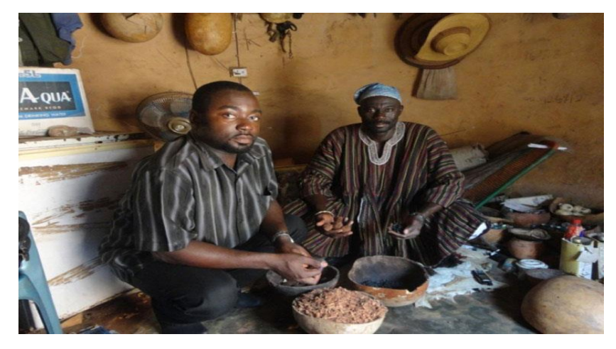
Picture 1. CSIR Research Scientist with a traditional herbal practitioner during an interview. In Ghana, around 70 percent of the population sees traditional medicine as a desirable and necessary means of treating problems that Western medicine cannot adequately remedy.

Over the decades, Ghana has made significant progress in promoting traditional medicine as a viable healthcare option. The drawback to this dream being fully accomplished is the traditional nature of the sector which makes it difficult to align to policy and good practice (GMP), Essegbey and Awuni, 2015. In Ghana, about 70 percent of the population sees traditional medicine as a desirable means of treating problems that Western medicine cannot adequately remedy, Essegbey and Awuni, 2015.